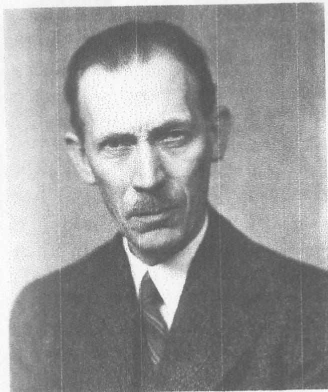
Johannes Nicolaus Brønsted (1879–1947).