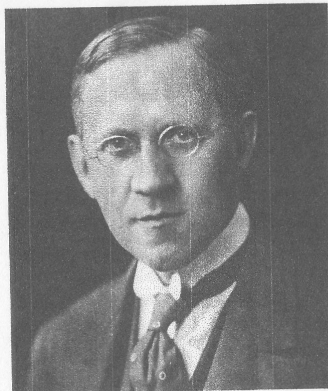
Thomas Martin Lowry (1874–1936).